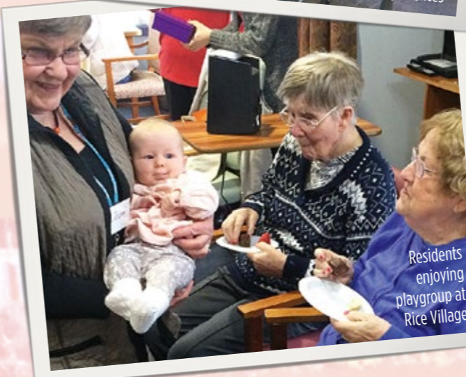
Residents enjoying playgroup at Rice Village

“I was concerned the headset may agitate someone living with dementia, but it was fantastic. One gentleman finds it hard to express his thoughts. After he took it off, he was able to tell us clearly about coming to Australia, what he likes about living here – it triggered enjoyable reminiscing. It was quite remarkable.