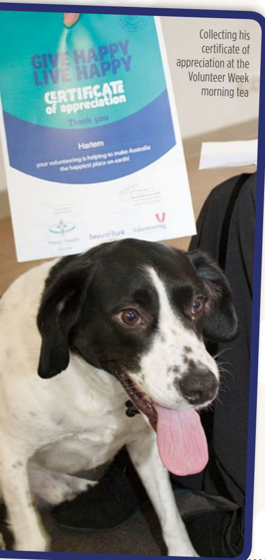
Collecting his certificate of appreciation at the Volunteer Week morning tea