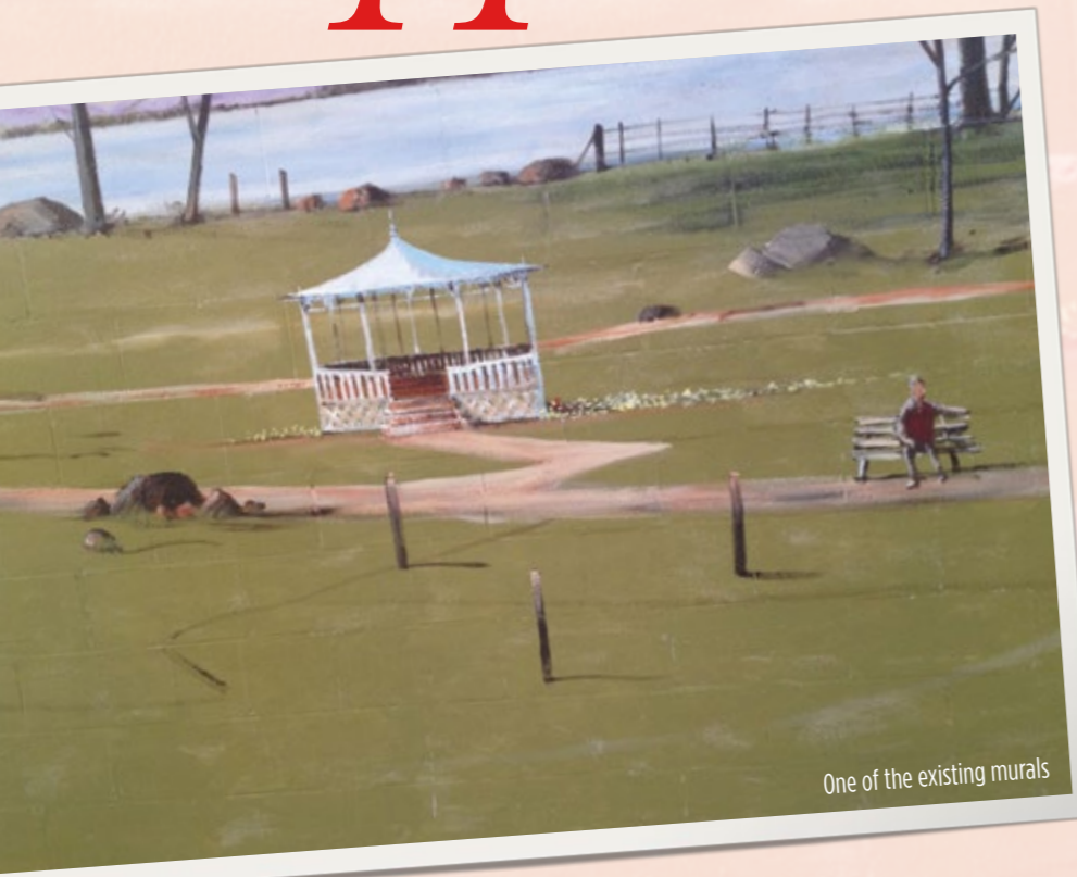
One of the existing murals

Imagine having a team of people around you, dedicated to ensuring you have the best day possible, each and every day.