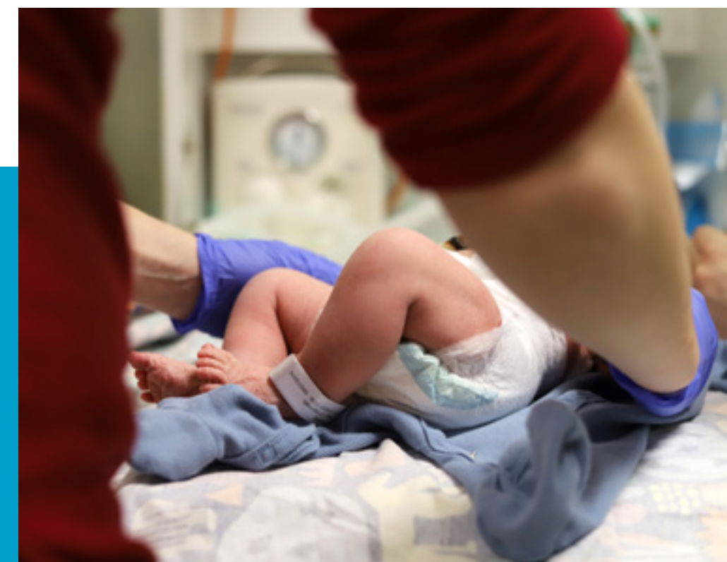
Baby at Mercy Hospital for Women.